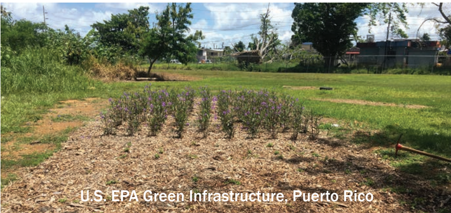
U.S. EPA Green Infrastructure, Puerto Rico