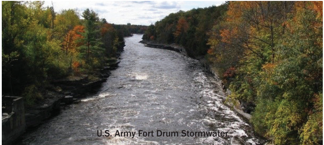
U.S. Army Fort Drum Stormwater